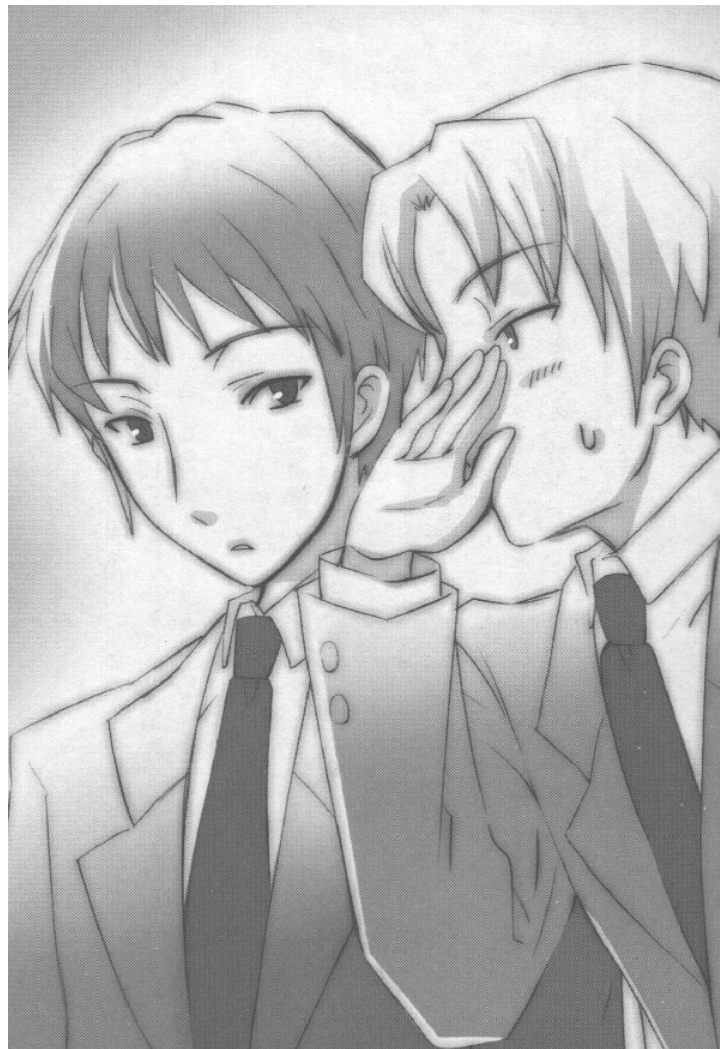
The president lowered his voice somewhat, and covered his mouth.

It would be better if it is this way, especially for Koizumi, and so I turned my gaze towards him, but that esper boy did not seem as happy as I had expected. He revealed a pensive look, crossing his fingers together and using that to support his head on the table. What trouble is it this time? He squinted as he watched Nagato, increasing my worry.